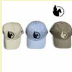
Ball Caps - $21.99