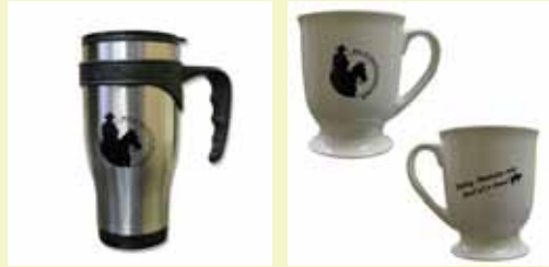
Coffee Mugs - $9.99

Many more items to choose from. Call 800-648-1121 or visit www.stagecoachwest.com to place an order today!