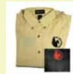
Western Button-Down Long Sleeve - $49.99