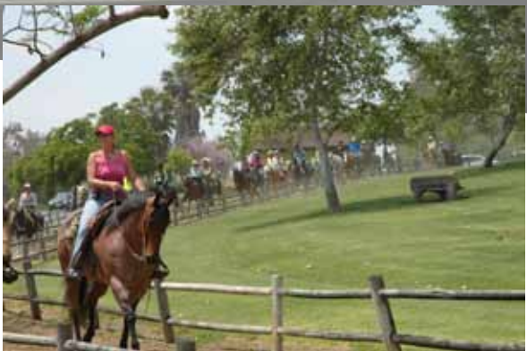
Grand Tour Trail Ride at Horsetown USA in Norco, CA