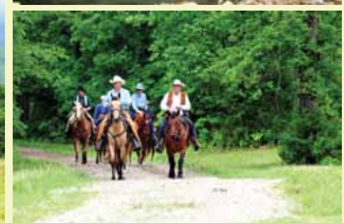
Photos from the trail ride at Circle E Guest Ranch, Belvidere, TN on May 13-15, 2011.

TO VIEW OR ORDER PHOTOS FROM THIS RIDE, PLEASE CONTACT: "The Picture Lady", Rita Bruner www.pictureladyphotos.com | picturephotos@aol.com | 731-445-7392