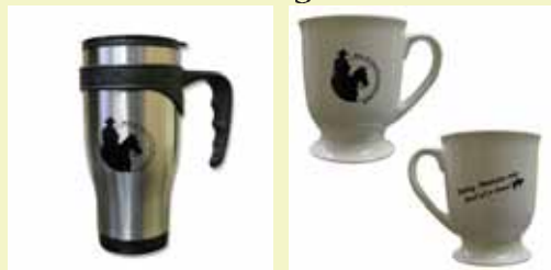
Coffee Mugs - $9.99

Tuesday (Premier) Wednesday (Encore) 4:00 pm Pacific 6:00 am Pacific 5:00 pm Mountain 7:00 am Mountain 6:00 pm Central 8:00 am Central 7:00 pm Eastern 9:00 am Eastern