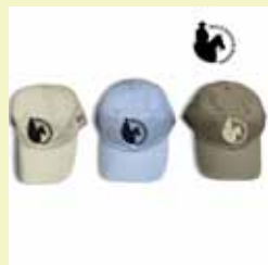
Ball Caps - $21.99