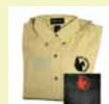
Western Button-Down Long Sleeve - $49.99